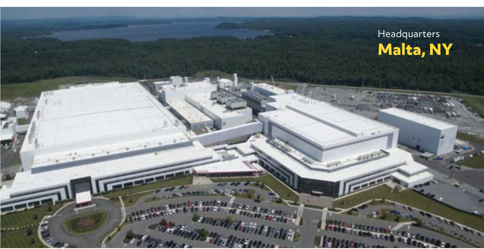
Headquarters Malta, NY